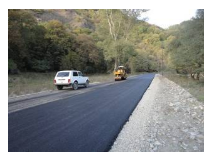
Charektar – Drmbon part First part (10 km)